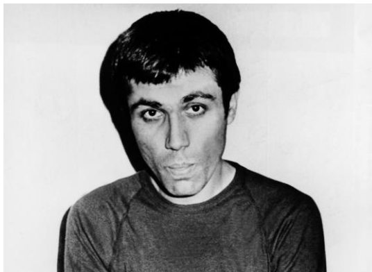
Mehmet Ali Agca

For reasons we will not go into at this point, as it would take us too far off course in this article, Pope John Paul II visited Turkey (a Muslim country) in 1979 – a visit which was not at all welcomed by the Turkish government, being considered (correctly) as papal interference in Turkish affairs. In addition, Moscow was watching events closely. This pope was pro-American, anti-USSR (although he was a Communist himself, he supported Catholic-Communism, not Moscow Communism). 61 The Kremlin wanted him out of the way; and it was not difficult for Soviet agents in Turkey to find and groom a young Turk, Mehmet Ali Agca, as the assassin.