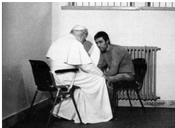
John Paul II speaking privately to Ali Agca in his cell

And then is Mehmet Ali Agca, the would-be assassin. And we have to ask, also: was it mere coincidence that the man chosen to try to kill John Paul II was a Muslim , on the payroll of the Soviets (thus there was the link between Rome's two great enemies under the pontificate of John Paul II – the Soviet Union and Islam), and that he made the attempt on the anniversary of Fatima? What was the impact, perhaps on millions of Muslims worldwide, when one of their own tried to kill the pope on the anniversary of "visions" given at a place called Fatima, the name of their prophet's revered daughter? And then, how much greater still was the impact on them, when that same pope attributed his survival to Mary – another woman greatly revered in Islam – and even forgave Mehmet Ali Agca, visiting him in his prison cell and holding a long conversation with him in private?