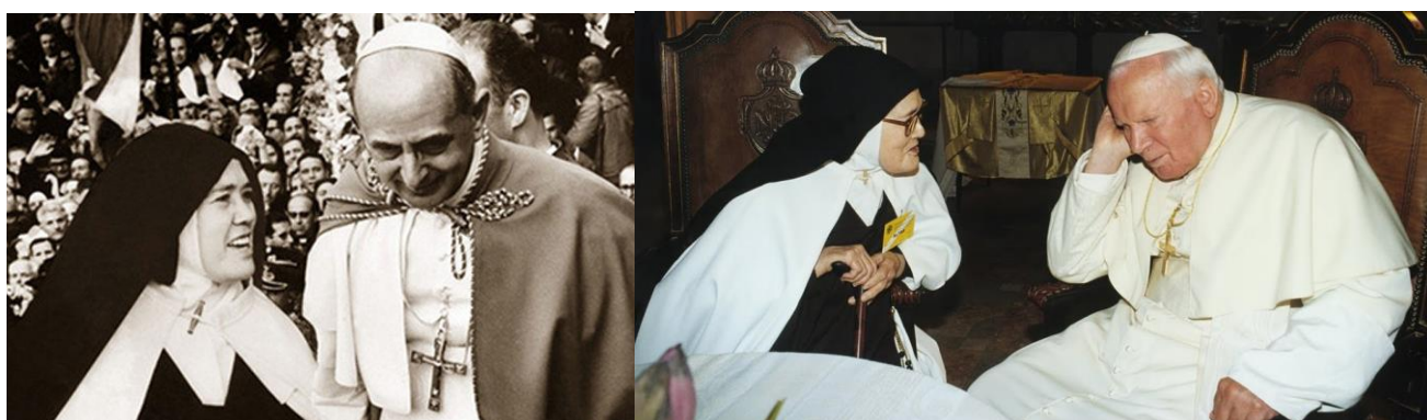
The later Lucia with Popes Paul VI and John Paul II

There are many, including many traditionalist Roman Catholic groups, who believe that the original Lucia died many years earlier, and that another woman was presented to the world as "Lucia" thereafter! However far-fetched this may sound, photographic evidence certainly creates doubts, as the later "Lucia" looks quite different from the earlier one. 41 She was also far more jovial, and relaxed, even when surrounded by high "Church" figures or in the presence of the pope of Rome himself – very surprising for a woman who had supposedly lived for many years as a cloistered nun, shut off from the world and especially from almost all male company.