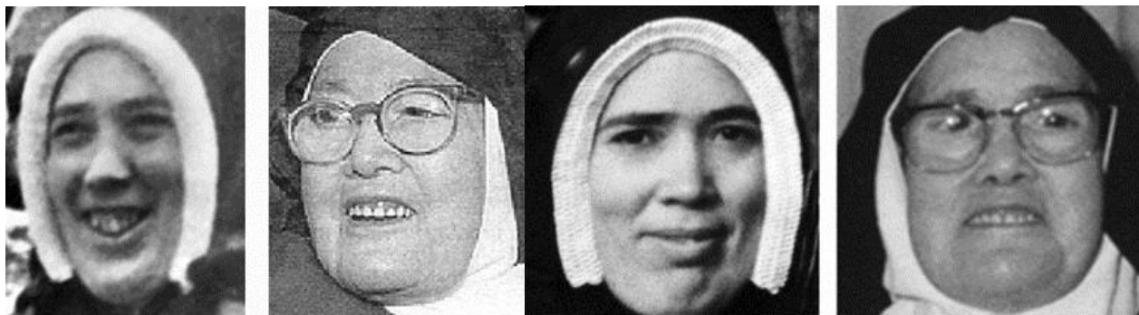
Two Lucias? Earlier and later photographs

Up until about mid-1989, it is claimed that Lucia always insisted neither one of the consecrations by John Paul II were valid. But since about mid-1989, she supposedly began to recognise the validity of the 1984 consecration. She said this was the real one, although she also said that this was her personal opinion, not a supernatural revelation. 40 But we have to ask: was she even saying anything at all about them at this time? Or was her name simply being bandied about by far more powerful figures? A pawn in a gigantic geopolitical Vatican power game?