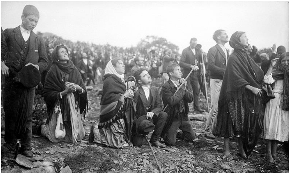
Part of the crowd watching the “miracle of the sun”

Analysing this journalist’s account, the following stands out. First: the most likely reason there were men who did not uncover their heads was that they had not, in fact, seen anything! The journalist does not even consider this. Second: although the journalist states that the “great majority” claimed they saw the dancing of the sun, there were said to be 70 000 people there. Did he interview, or even hear the comments, of the “great majority”? Impossible. He would have only heard the comments of a small fraction of that immense crowd. Third: if this was a real miracle from God, why did they all see such different things? Why did only some claim to see “Mary”? After all, she was at the very centre of the entire Fatima business.