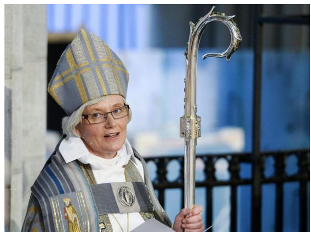
Lutheran Primate of Sweden, arch-priestess (they call her archbishop) Antje Jackelén (looking decidedly Papist-like in her ridiculous getup (as if any true Christian Church even has women pastors, much less priestesses in it!)

Among other things, Lutheranism retained the damnable heresy of baptismal regeneration – that by baptism, one is born again. It also retained the concept of a "State Church", which meant it kept the persecuting spirit of its mother, and was filled with unregenerate people who considered themselves to be Christians just because they were born to Lutheran parents and baptized in the Lutheran way. And its doctrine of consubstantiation was only marginally different from the doctrine of transubstantiation in the Roman Catholic mass.