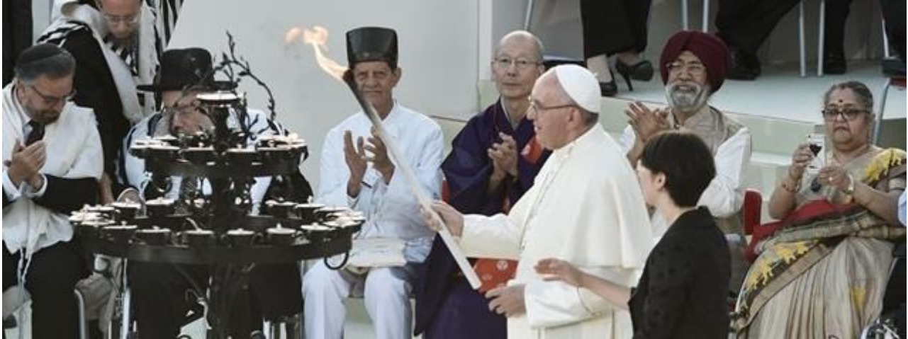
The 2016 abomination