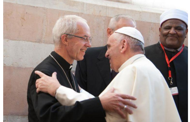
Francis Embraces Anglican Archbishop Welby