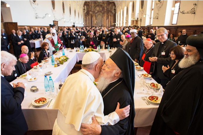
Francis Embraces Eastern Orthodox Leader